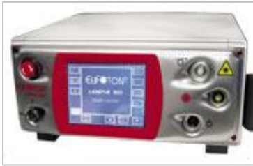
LASEmaR 800 LM8